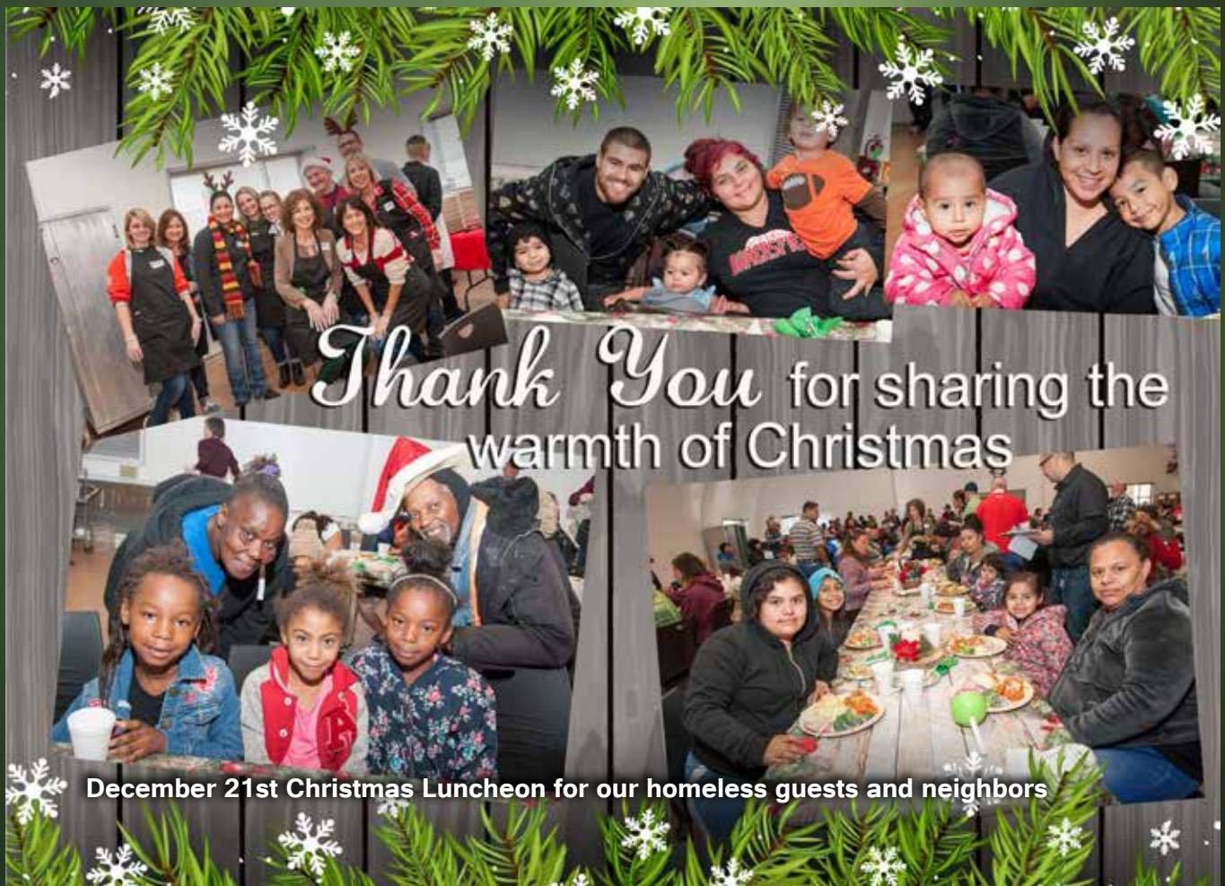
December 21st Christmas Luncheon for our homeless guests and neighbors

"...we have this treasure in jars of clay to show that this all-surpassing power is from God and not from us . We are hard-pressed on every side, but not crushed; perplexed, but not in despair; persecuted, but not abandoned; struck down, but not destroyed. We always carry around in our body the death of Jesus, so that the life of Jesus may also be revealed in our body." 2 Corinthians 4:7-9