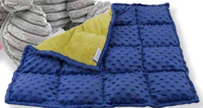
Examples of sensory toys pictured: BKids Senso Croco Sensory Toy Abilitations Weighted Kordy Elephant Harkla Weighted Blanket for Kids

For information about Rescue the Children, volunteer opportunities, meeting ongoing needs, or to take a tour, contact Community Engagement at (559) 268-0839.